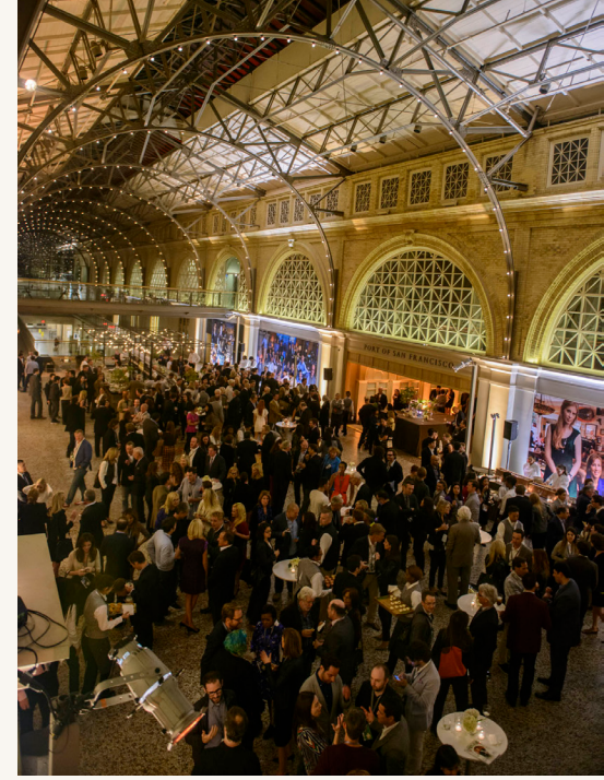
The Ferry Building on the Embarcadero